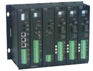
PCM2000 Paging Control System