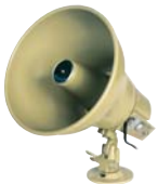
SPT15A Horn Loudspeakers