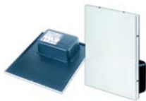
CSD2X2 Ceiling Tile Speakers